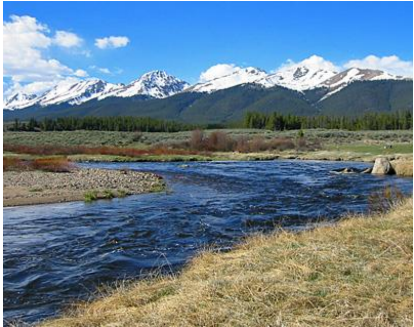
Upper Taylor River above Taylor Reservoir

The Taylor River flows from the snow pack high in the Colorado Rockies, from the peaks surrounding Taylor Park. The river drains into Taylor Reservoir at about 9,300 feet. The tailwater below the dam flows down through Taylor Canyon some 20 miles before it joins the East River to form the Gunnison River at Almont.