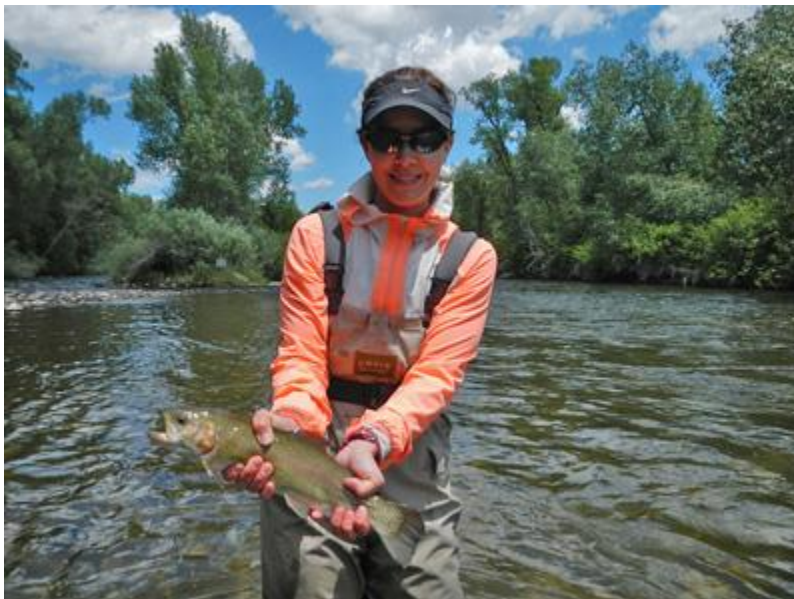
Gunnison River Rainbow Trout

The upper Gunnison River is impacted by both snow-melt and the controlled releases from Taylor Reservoir. The Gunnison is best fished from a boat in the early season during high water. There are plenty of public access points for wading the river during summer and fall.