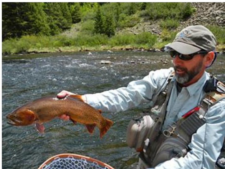
A nice Cutthroat from the Taylor River C&R stretch

The C&R section of Taylor River is trophy trout water which includes about .4 miles of river designated catch-and-release by Colorado Parks & Wildlife (CPW) . The special regulations permit flies and lures only, and all fish caught must be returned to the river. There are signs which clearly mark the boundaries of the C&R section, which is patrolled by CPW. They routinely check anglers for proper fishing licenses and habitat stamps. There is a parking area with portable restroom facilities next to the bridge just beyond MM20.