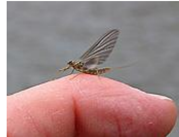
Early Season Mayfly

The main early season hatches consist of midges and the first mayfly hatch of the season - the Blue-Winged Olives (BWOs). The BWOs can hatch as early as mid to late March, depending on weather and water conditions. However, we normally see this hatch around mid to late April or so as water temperatures rise. Fish activity will increase in early spring when water temperatures rise over 40 degrees.