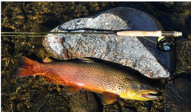
25-inch Brown Trout from upper Taylor Canyon

From the public access area just above Harmel's Resort at about MM7 all the way to the C&R section below the dam, the river tends to be higher gradient with big boulders and lots of deep pocket water and whitewater. Between Harmel's and the next highway bridge at South Bank, there is very good water which holds some big trout. There is easy access here with plenty of parking. There is a campground