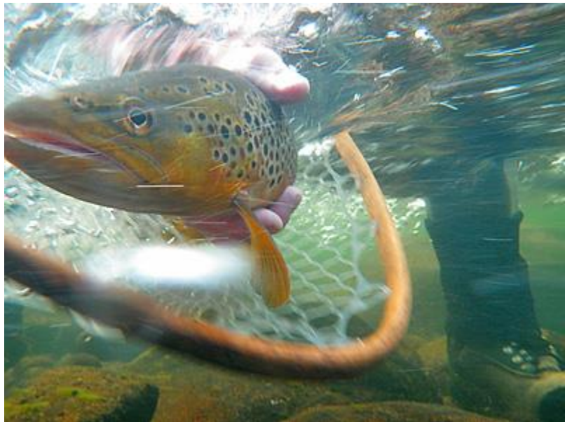
A nice Taylor River Brown Trout

Fishing dry-dropper rigs during summer can be very effective. This involves fishing a dry fly with a nymph or emerger dropped below it. You can also fish a hopper on top with a nymph below it (hopper-dropper rig).