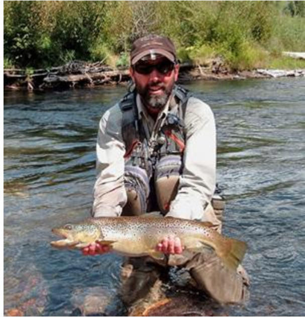
27-inch Brown Trout caught in September