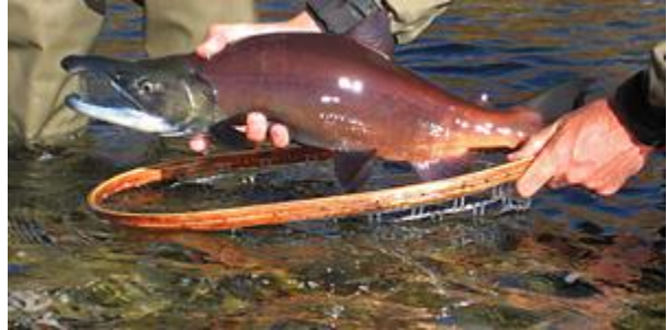
Kokanee Salmon on the East River

The East River is a low gradient river with nice long pools and plenty of riffles. The East is easily waded and a very enjoyable river to fish. The section by the hatchery is wild trout water with special regulations (flies only). The river holds nice rainbows, browns, and some cutthroat. Due to the limited public access, it can get busy on this stretch, especially during the salmon run.