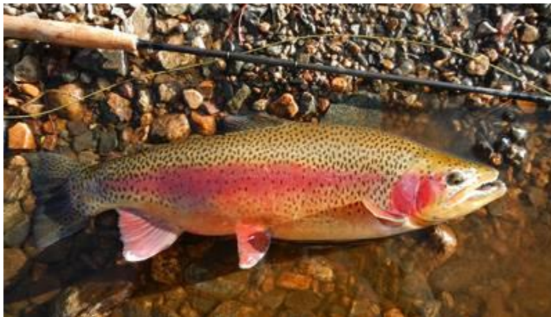
A thick Rainbow Trout from the Taylor River C&R section

The upper section of the Taylor River just below the dam is designated catch-and-release (C&R) water. This is trophy trout water with some fish in the 8 to 12-pound range. These big wild trout enjoy a constant food source which includes a steady diet of Mysis shrimp and midges. The C&R section can be very challenging and requires some technical angling skills. This section of the Taylor River can be fished year round.